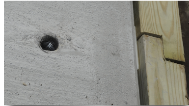
STANDARD LIFTING SOCKETS (1.25" - 7 TPI)