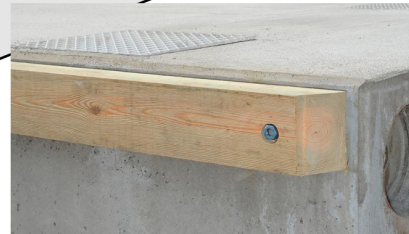
OPTIONAL PT WOOD WHALERS

CALL US TODAY (908) 526-1040 FOR DELIVERY SCHEDULES