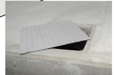
OPTIONAL ANCHORING WELLS