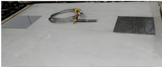
OPTIONAL STRINGING WELLS WITH BUSHING AND CABLES